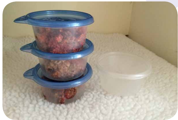
Raw food ready to travel and water dish

Keep the bag with the pup's things easily accessible as you pack the car. It's amazing how often the bag you need most winds up at the bottom of the pile if you don't plan your packing in advance.