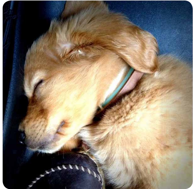
Get on the road when the puppy is tired

It is not always possible to time the above list perfectly, but keeping these things in mind you and your breeder can do your best to get off at the right time.