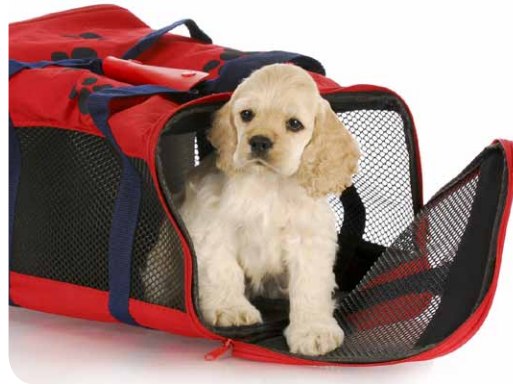
Remember to only give treats while she is in the travel bag