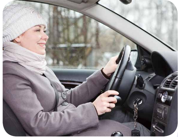
Be sure to dress warmly so you can keep the puppy comfortable

When puppies are hot you will know it because they cry, move around and cannot get comfortable. And puppies are often hot when the temperature is comfortable for us. Even if you are traveling in the dead of winter, be prepared to keep the car cool. Bring something warm to wear for each non-doggie passenger in the car and keep the temperature in the car cooler than you would probably like in order to allow your pup to be comfortable. If your puppy is crying during the trip, and you know she does not have to potty, she likely is hot.