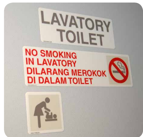
Bring your travel pack to let her potty

That's about it except expect to be the most popular person in the airport with your new pup. Passengers love to meet puppies while they wait for their planes. Flying is a great experience for your pup so enjoy the trip!